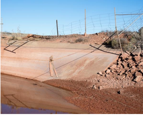
Debris, New Mexico, 2018