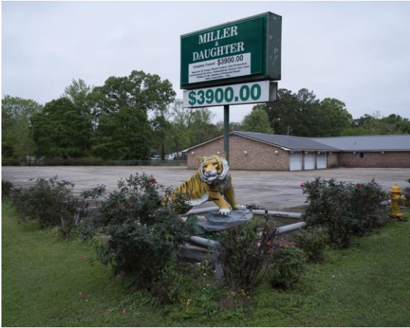
Mortuary, Zachary, LA, 2020