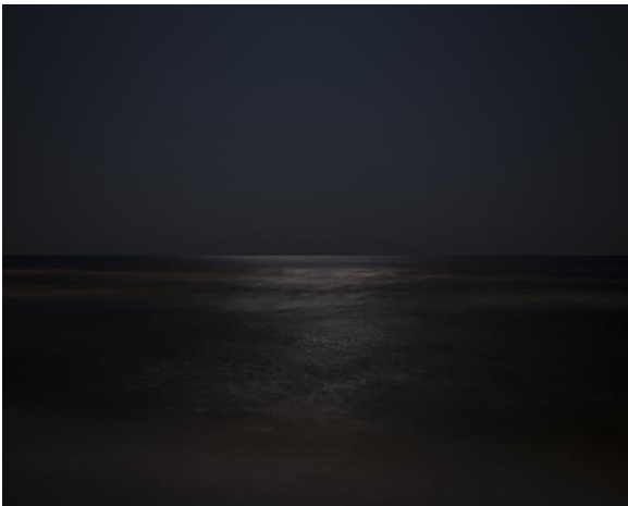
Florida Coastline, Nightfall, 2020