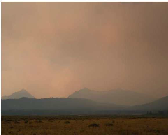
Wildfire, Idaho, 2016