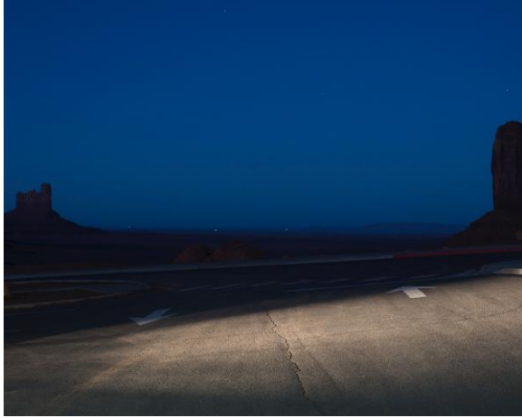
Monument Valley Navajo Tribal Park, Arizona, 2018