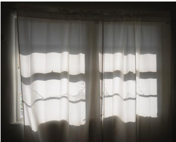
Window, Kansas, 2020