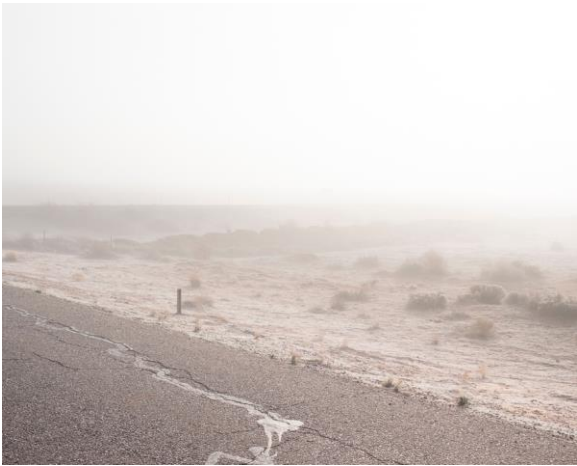
US 163, Utah, 2018