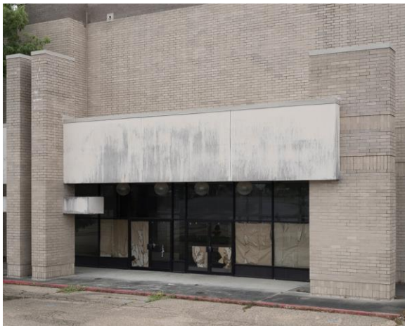
Shopping Center, Baton Rouge, LA, 2020.