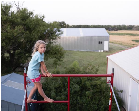
Gretta, Russell County, Kansas, 2020