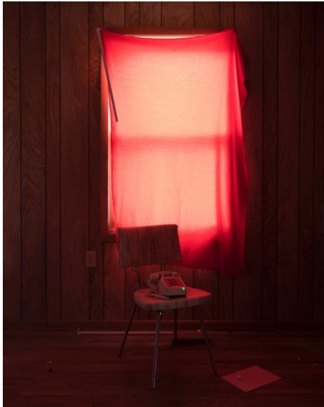
Telephone, Russell County, KS, 2020

We Hold These Truths is a selection of photographs made across the U.S. during the Trump presidency. Drawn from the Declaration of Independence, the title implicates “We” the viewer as an active participant, acknowledging the collective responsibility shared in our democracy. The photographs reveal the anxiety felt across the nation and speak to this historic moment, as tensions run increasingly high in the run-up to the 2020 presidential election.