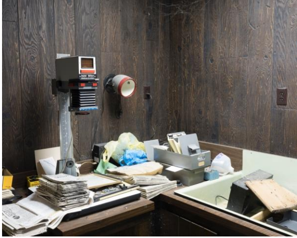
Former Darkroom, Haskell County Monitor-Chief, Sublette, KS, 2020.