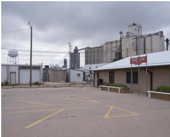
Sublette, KS, 2020.