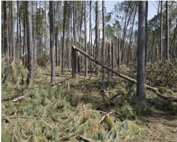
Aftermath of Hurricane Sally, Alabama (I), 2020