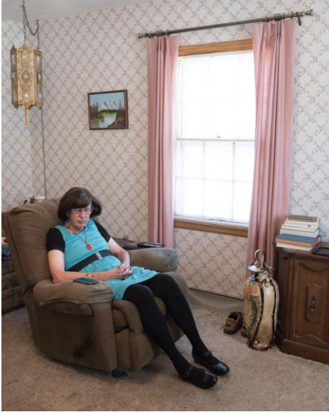
Scarlett, Ellinwood, KS (Listening to the Supreme Court Decision Guaranteeing Civil Rights Protection for Gay and Transgender People), 2020.