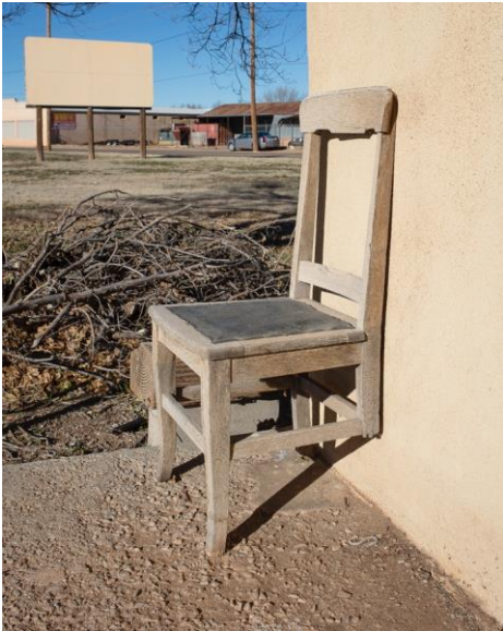
Chair, Tucumcari, NM, 2018