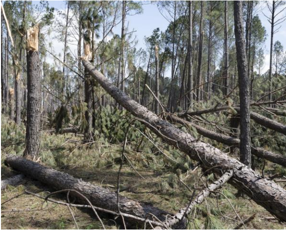
Aftermath of Hurricane Sally, Alabama (II), 2020